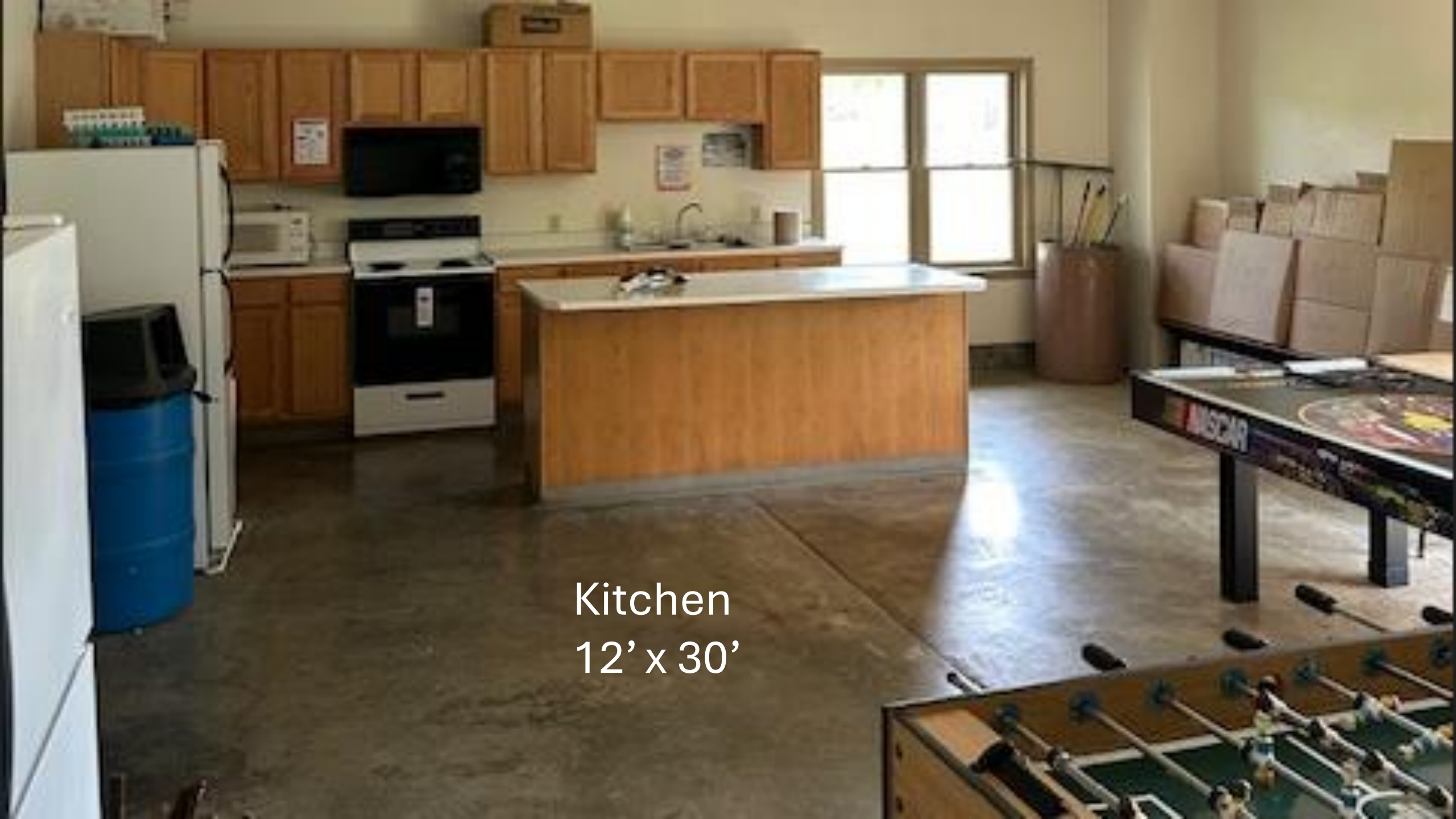
Kitchen 12' x 30'