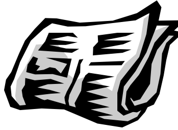
The Emmaus News