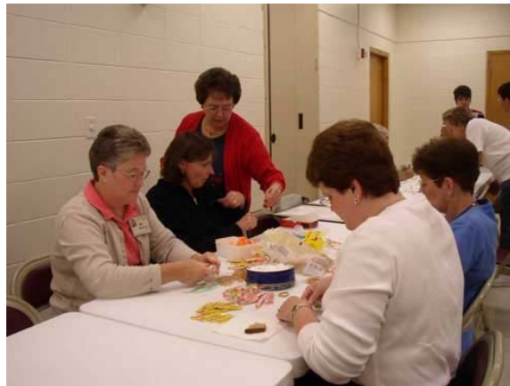
Loving hands make Agape for pilgrims at a recent Emmaus Gathering.